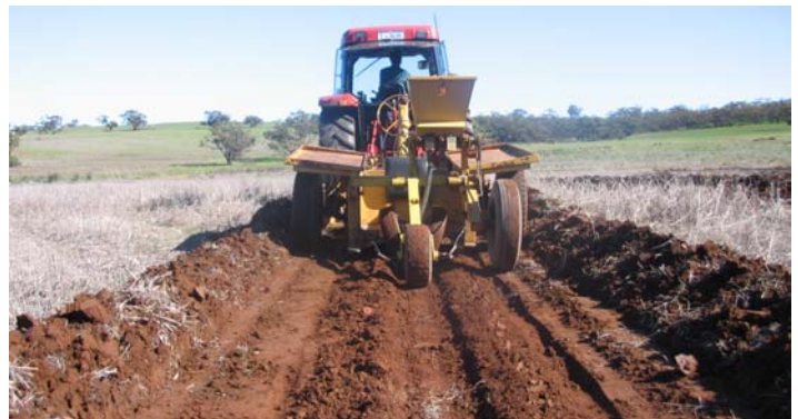
Direct seeding Bethan Lloyds property, East Toodyay (380mm), 18 th July 2005.

All direct seeding in the Avon was conducted with a Chatfield planter that scalps, rips and seeds in a one pass operation. In the Blackwood / Hotham, several sites were direct seeded using a Chatfield planter and several with a modified direct seeding machine (Egad) pulled by a 4WD ute. Host seed was bulked up with fine vermiculite.