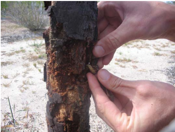
Extracting cossid moth larvae (Family: Cossidae), from 6 year old Jam ( A. acuminata ) trees, Aaron Edmonds property, Calingiri, October 2005