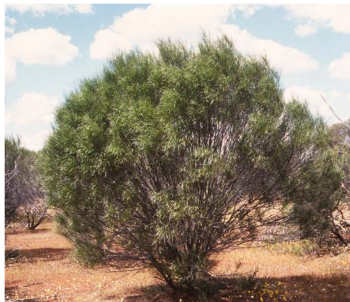
Figure 2. (bellow) Acacia burkittii .