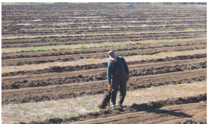
ASN member Jim Ruggles (Beverley) completes a 5 hectare host establishment project (July 05), combination of direct seeding and seedlings