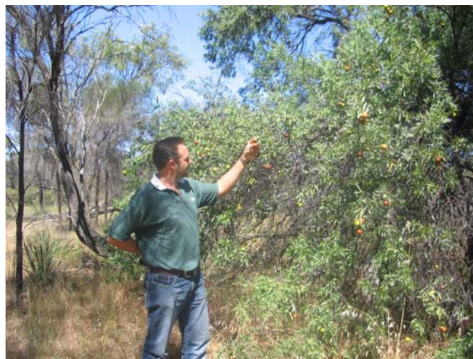
ASN Secretary inspecting seed ripening in remnant trees, Northam district

Further information and application forms can be obtained from CALM's Naturebase website www.calm.wa.gov.au/plants_animals/licensing/flora_licensing.html or by contacting CALM's Wildlife Licensing Section on 9334 0441.