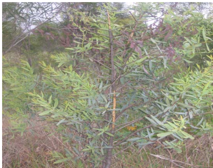
Recent parrot damage in 4 year old plantation sandalwood in the Tammin area, September 2005

Parrot numbers can be significantly reduced by trapping and shooting, however it is up to the tree grower to decide if an investment in parrot control is worth the effort.