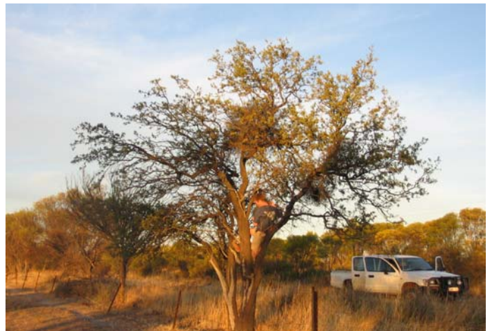
ASN member Geoff Woodall scaling a remnant sandalwood tree to assess mistletoe infestation