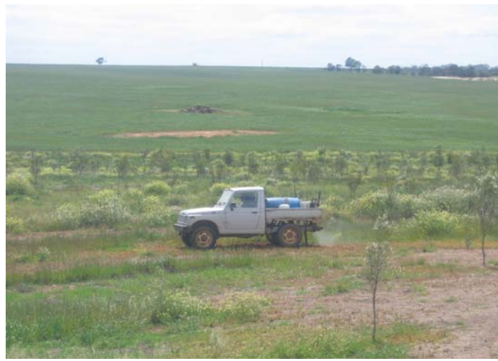
ASN member Pat Butterworth, east Beverley, inter-row weed spraying in young plantation, Sept 2005