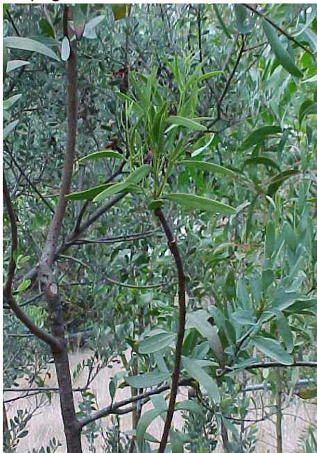
Photograph 1. Six month old quandong scion (Aug 2004 to Feb 2005, Clarendon SA) on sandalwood ( S. spicatum ) rootstock (graft at approximately 1.5 metres). Note the difference in leaf shape between scion and rootstock.

Lethbridge B. (2005) Field Grafting of Quandong ( Santalum acuminatum ) Sandalwood Research Newsletter. Issue 20, pages 1-2