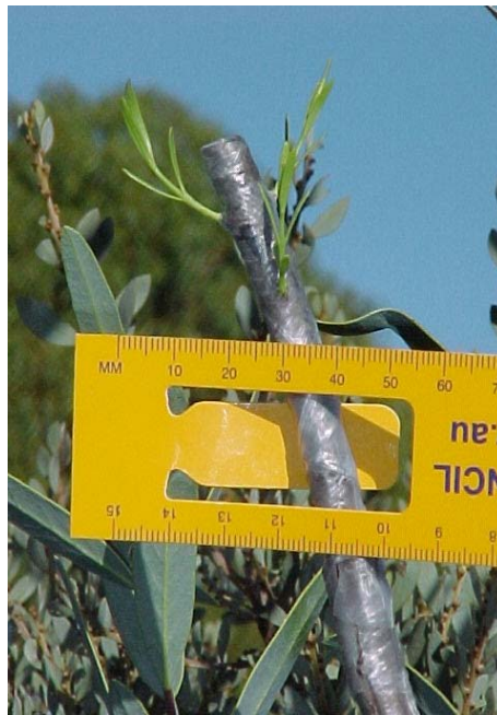
Photograph 2. Three month old autumn graft of quandong on sandalwood ( S. spicatum ) rootstock (02/03/05 to 02/06/05)