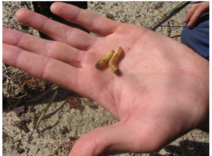
Cossid moth larvae. Related to witchetty grubs, they can ring bark Jam trees. Trees under stress are more vulnerable to attack