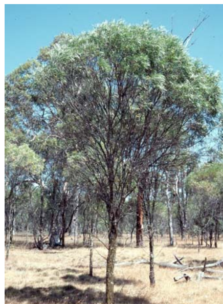
Figure 1 (left) Acacia acuminata (Typical variant).

In general, when growing jam in plantations, it is best to use the local variant of jam. The local form of jam is less likely to be stressed by the local environmental conditions (e.g. annual rainfall, evaporation, soil type) which can weaken the trees and make them more vulnerable to diseases, such as gall rust fungus ( Uromycladium tepperianum ).