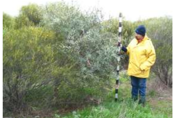
Felicity Eddnie-Brown measuring plantation growth