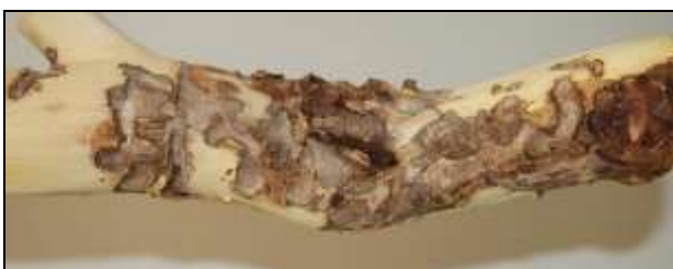
Figure 1. Jam ( A. acuminata ) sapwood damage caused by the Fruit Tree Borer ( Maroga melanostigma ) in its larval stage.

Funding provided through the Avon Catchment Council, South Coast NRM Inc. with the support of the Western Australian and Australian Governments through the joint National Action Plan for Salinity and Water Quality program and the Natural Heritage Trust