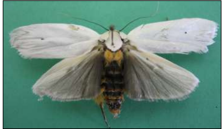
Figure 2. The Fruit Tree Borer (in adult moth form). 10-15mm in length