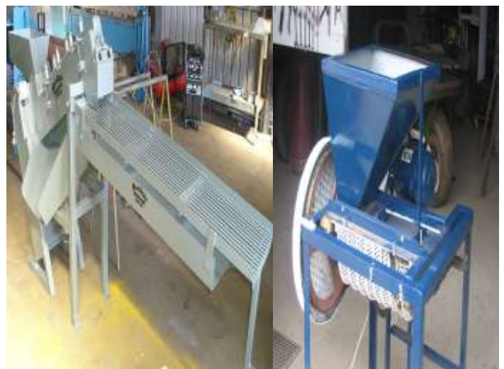
De-husking demonstration in Northam, January 2007.

The next Autumn Field Day event will be held in early April!