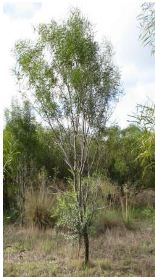
Figure 1: Influence of relative humidity on sandalwood fruit moisture content. Data generated by placing the same component parts of 10 fruits in air of differing relative humidity (RH) for 48 hours prior to determining resultant changes in component mass.

Even during summer, husks that were brittle the day before may absorb moisture from the atmosphere over night (when the relative humidity rises) and one may find that husks take until mid morning before they become brittle again.