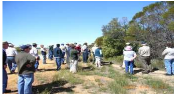
Participants of the Borden Field Day, inspecting a recently established site North East of the Stirling Ranges, 15 th March 2007

The following event held in Esperance was attended by a smaller though very enthusiastic group. Including presentations and visits to the Helms Arboretum (to inspect an impressive stand of sandalwood host Acacia acuminata ) and a FPC plantation with 3-4 year old sandalwood, the day was also very successful. Many thanks to all involved for their participation and support.