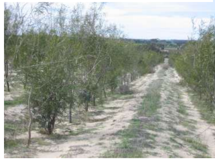
Above: Hosts planted (Jam) 2004, sandalwood seeded 2005, plantation on unproductive sand, Tammin central wheat belt