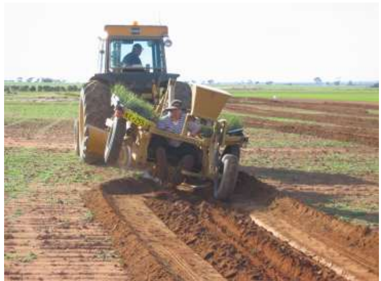
Above: It was all smiles for Jen and Garry of Doodlakine during the establishment of their 4 hectare sandalwood plantation in granite country east of Kellerberrin, until Jen experienced wild ride as the tree planter hit a rock. Slow speeds, a low hp tractor and caution required when using mechanical tree planters in rocky terrain.