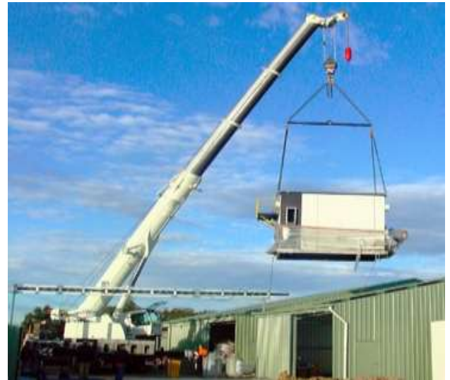
New 4MW boiler being installed at Mt Romance

The Sandalwood Factory in Albany is an essential tourism experience; we offer a number of activities for visitors to the Albany area. Our factory tour is very popular, during which we explain the Sandalwood story from history to growing, harvest and to Sandalwood Oil extraction and further value adding through the manufacture of perfumes, skin care and cosmetics.