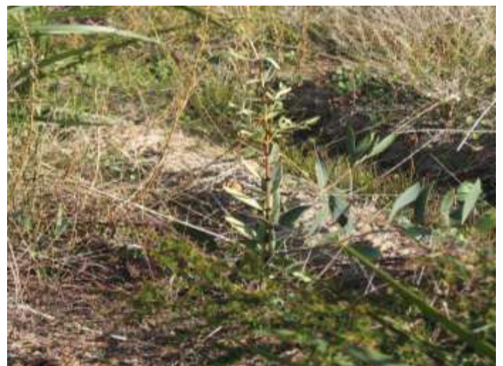
A live tree 'on its way out'