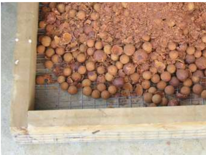
Geoff Woodall demonstrates a nut sucker at the April field day.