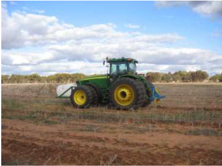
Left: Pre-ripping a 20 hectare site in April 07, using GPS auto steer technology