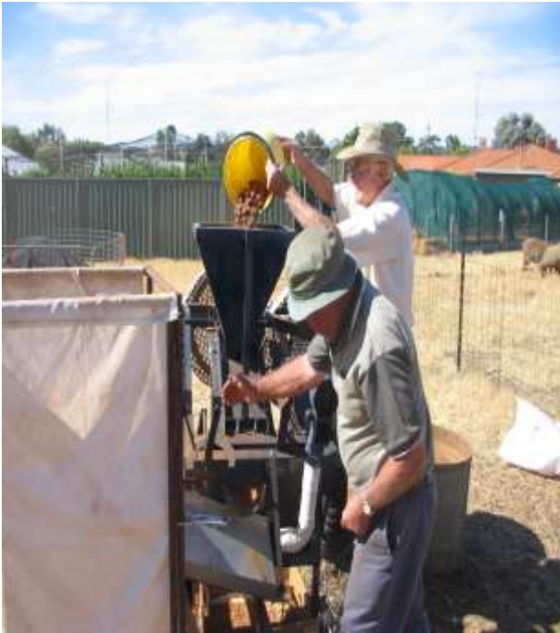
Sandalwood seedling amongst direct seeded and seedling hosts

In terms of current practice, the FPC generally establishes Sandalwood plantations using Acacia seedlings as the host with Sandalwood nuts placed next to the seedlings when they are a year or two old which is a generally accepted method for commercial plantation establishment. However the FPC is also trialling direct seedling techniques and a combination of seedling and seeding systems in a one year establishment operation with encouraging results materialising.