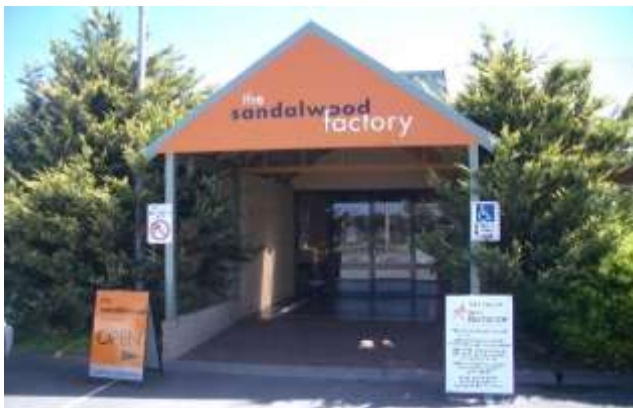
Sandalwood Factory, Mt Romance, Albany

It is the intention of Mt Romance to offer a strong, stable domestic market for Sandalwood growers in Western Australia. In doing this we hope to encourage the local plantation industry to continue develop and expand as growers realise the potential of this valuable commodity.