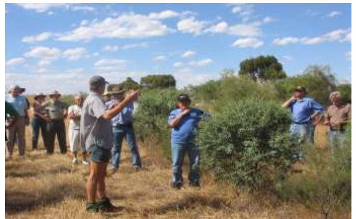
The enthusiastic group at the Esperance Field Day 22 nd March 2007