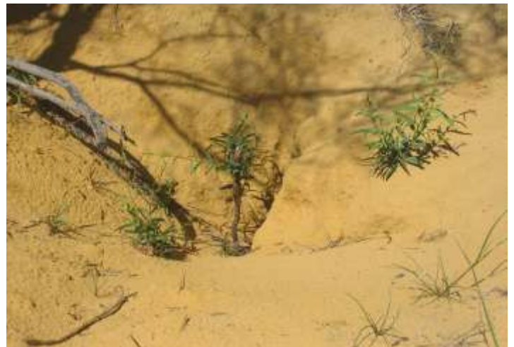
Above: At the ASN field day in Cunderdin / Tammin in late 2005, the young plantation sandalwood tree on the left was pulled out at the field day, to demonstrate debarking and inspect for heartwood. I re-visited the site 6 months later to find the tree had re-shoot (coppiced) from some small remaining roots.