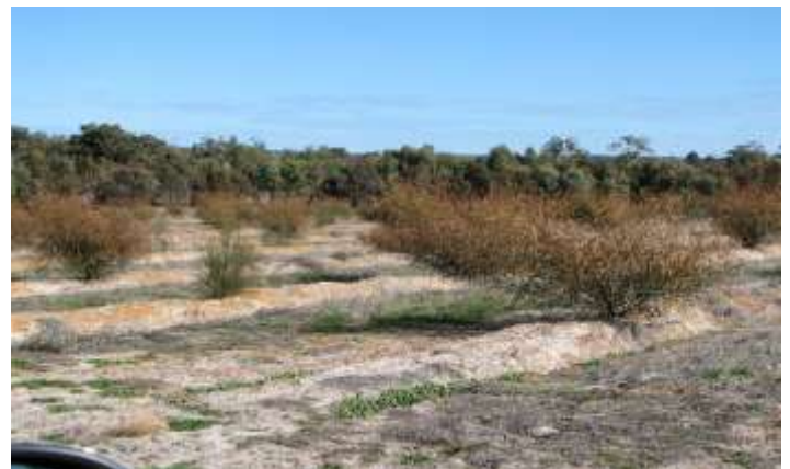
Inspecting a dead sandalwood tree to be harvested. Estimated weight 200+ kg